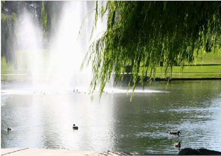
Coming into the park, off to the left, this is what you'll see