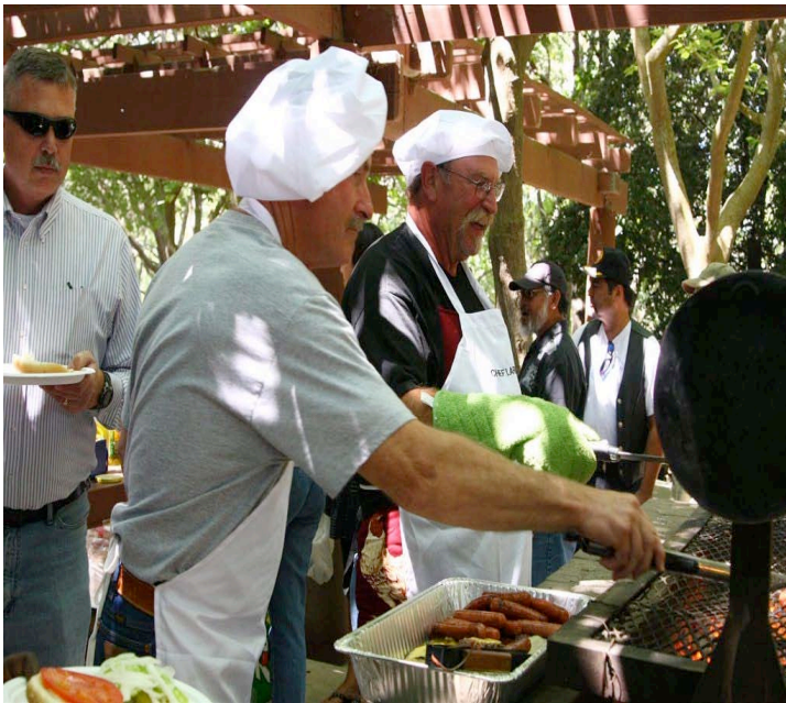
This is "team work" ☺