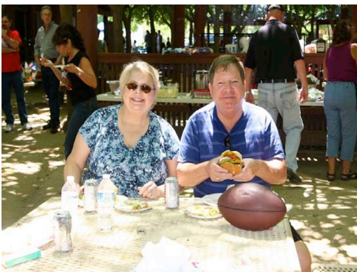
Look at the size of that burger!