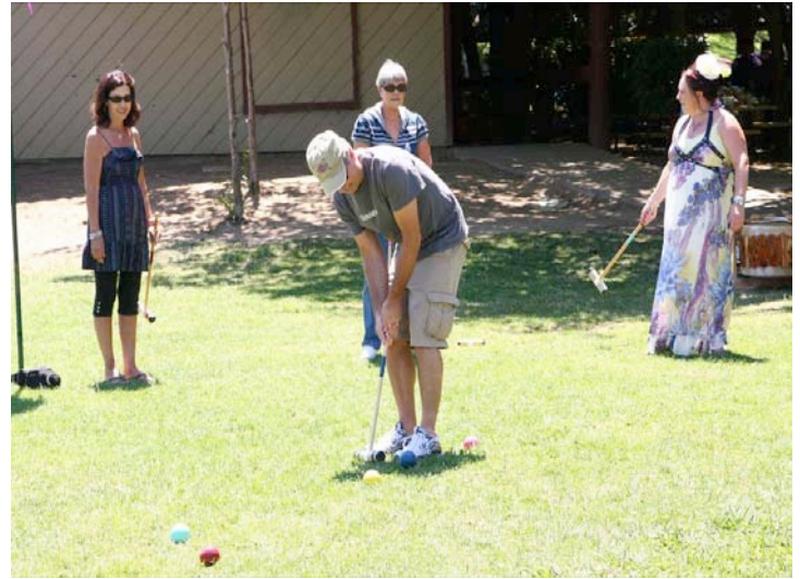
The croquet hopefuls