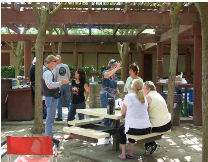
Riding in the Sticks with #186